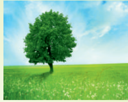
Clean, Green & Natural Surroundings