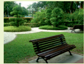
Lush Green Garden